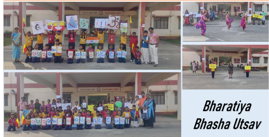
Bharatiya Bhasha Utsav

The birthday of Tamil poet, Mahakavi C. Subramaniya Bharati on 11/12/2023 was celebrated as Bharatiya Bhasha Utsav- The language festival for enjoying the beauty of language, its diversity and to experience the feeling of oneness in diversity. Students performed a special assembly to highlight the significance of multi lingual cultures. They performed skit, songs, dance and delivered speech that portrayed their love and pride in exhibiting their native and regional languages to others.